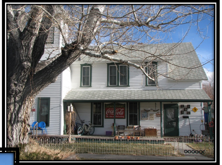
Front View Facing 14 th Street