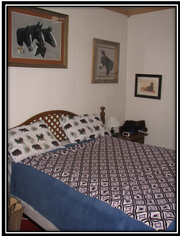
Bedroom One - Main Level