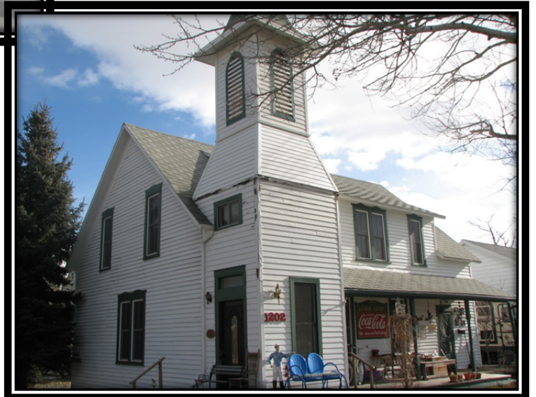
Roaming Cowboy Bed & Breakfast