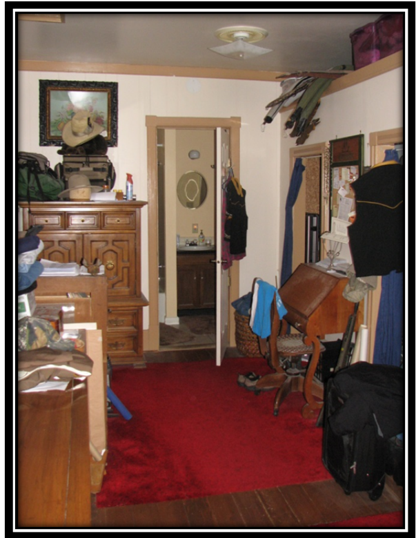
Hallway - Upstairs