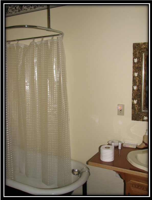
3 Full Baths