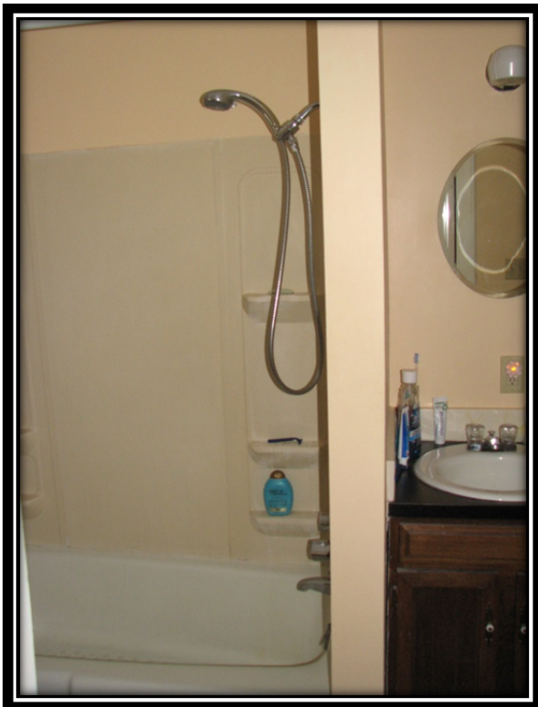
Full Bath One - Main Level